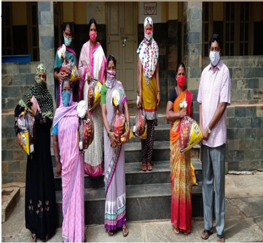
Food Kit distribution to the needy Widow's Family.

This year from our Centre, we have 6 boys and Durgamma writing SSLC and PUC Exams respectively.