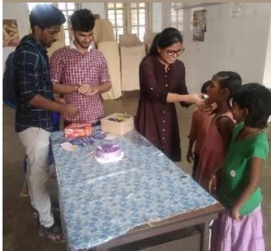
Dental Students Celebrating Birthday with us

The feast day celebration started with a prayer service and dinner for the religious friends of DBCLM on 30 th evening. The celebration on 31 st had a prayer service for the staff and children followed by cultural programme by the children in front of the invited guests and a sumptuous meal for all on 31st. The celebration ended with the feast day mass and procession in the evening.